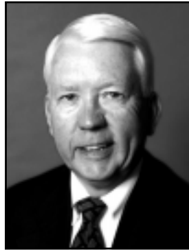
Charles J. Arntzen

Dr. Kumanyika has been involved in numerous advisory, policy, and consensus-development activities within the United States and internationally. She chaired the working group on Public Health Approaches to Obesity Prevention for the Council of the International Obesity Task Force. Other IOTF activities included participation in a WHO workshop on obesity prevention in 1998, a national strategy workshop on obesity in Australia in 1999, and one in Barbados for the Eastern Caribbean region in 2000.